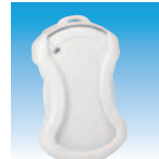
5802MN2 Dual-Button Personal Panic