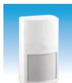
5897-35 Wireless DUAL TEC™ Motion Detector