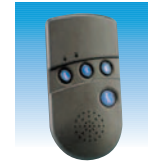
5804BDV Talking Bi-Directional Key