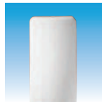
5815 Door/Window Transmitter