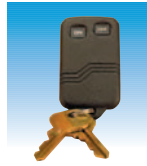
5804-2 Two-Button Key