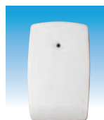
5853 Glassbreak Sensor