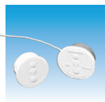
5800Micra Recessed Transmitter