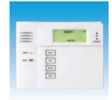
5828V Talking Fixed English Keypad

Honeywell's 5800 Series out-performs every other transmitter in the industry. All 5800 Series transmitters send supervisory messages to the control, as well as tamper and low battery notification. Built for year after year of reliable service, most of the devices include readily available, user-changeable lithium batteries, which provide longer life than conventional alkaline batteries and feature a demonstrated outdoor range of over a mile.