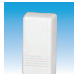
5816 Two-Zone Door/Window Transmitter