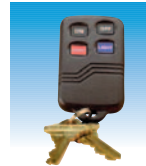
5804 Four-Button Key