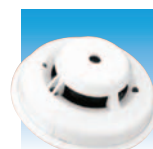
5808LST Low Profile Smoke and Heat Detector