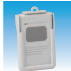
5802MN Single-Button Personal Panic