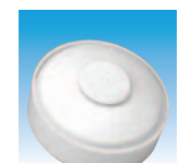
5809 Rate-of-Rise Temperature Sensor