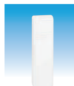
5819WHS Self-Contained Shock Sensor, Processor and Transmitter