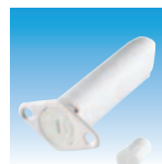
5818MN Door/Window Transmitter