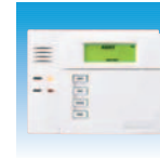
5828 Fixed English Keypad