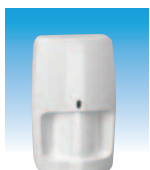
5894PI PIR Motion Detector with Pet Immunity